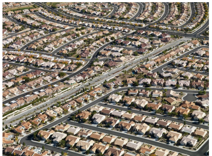
Las Vegas, NV Sprawl

Half-day kindergarten, while still a fixture in some communities, is essentially gone in most urban school districts, replaced not only by full-day kindergarten, but also all-day pre-kindergarten and even the expansion of public pre-school for three-year-olds. This has been possible, in part, because of the presence of unused space in school buildings where the number of school age children has declined. These underutilized school spaces also serve as potential sites for the expansion of school-support joint use, as well as community-related joint use, especially for the location of services such as adult education, job training, or sports leagues that can enhance opportunities and outcomes for under-privileged communities.