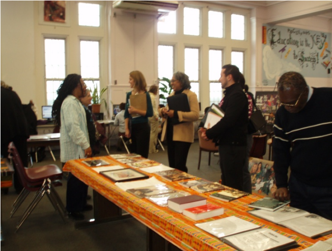
Community art exhibit at Cardozo High School

Related to each of these types of joint use is an interest in joint development. Joint development of new or existing public school facilities enables the site, building plan and design to better support the joint use of the building and land. Successful joint development requires the public education, civic, school, community and real estate users to collaboratively articulate a vision, develop a plan for design, agree on a schedule, and agree on how building and site costs will be paid for and maintained. Ongoing joint use agreements are necessarily a part of joint development agreements. Other public agencies, as well as private developers, may be interested in joint development—particularly of school property in desirable locations given their size, scale, amenities and/or proximity. Public agencies may be interested in locating affordable housing, recreation centers, libraries or elder service centers on school sites. Private developers may be seeking to take advantage of existing public infrastructure to address pent-up demand for housing, commercial, or retail space not already available. Similar to joint use, joint development may be school, community, or real estate driven.