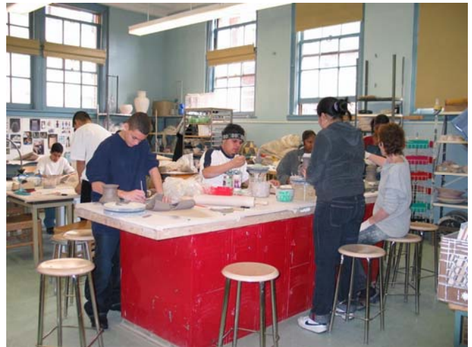
Julia Richman Education Complex Ceramics Studio

obesity. 15 Increasing rates of sedentary leisure activities and vehicle use does not encourage physically active lifestyles, especially for children. 16 Additionally, many neighborhoods lack pedestrian infrastructure and/or do not have public open spaces such as parks or social common areas that incorporate physical activity into everyday life. In other cases, existing outdoor spaces may be deemed or perceived as unsafe or unfit for use. Also, many parents do not permit unsupervised play in crime-ridden communities and are often unable to provide this supervision themselves. As a result, children not attending afterschool programs stay inside watching TV and playing video games.