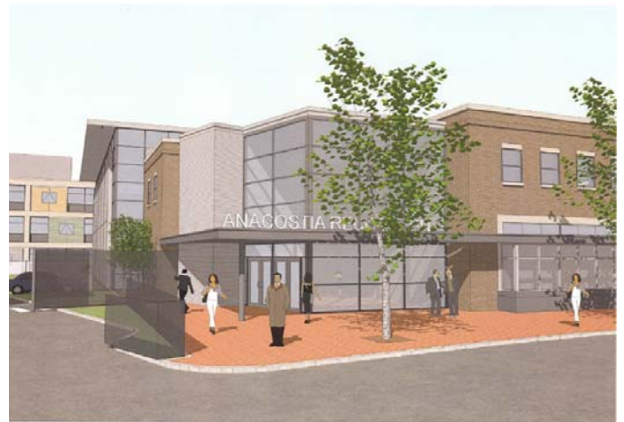
Savoy and Thurgood Marshall Sports and Learning Center

We propose that a fundamental shift is needed in how we view our public school buildings and grounds; a new social contract for the use of our public school infrastructure.