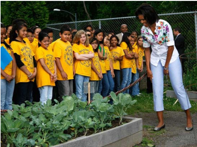
First Lady Obama at Bancroft Elementary School

factors in the physical environment;” opening them can directly increase access to recreation space, especially outdoor green spaces, translating into increased opportunities to participate in physical activities. In searching for ways to increase healthy physical and social habits of both children and adults, public health advocates have identified these public infrastructure assets—public school buildings and grounds—as places that can and should play an important role in increasing physical activity not only among children and adolescents but also contributing to healthier communities. 18 In some communities neighborhood schools may be one of few places where children can be involved in active play.