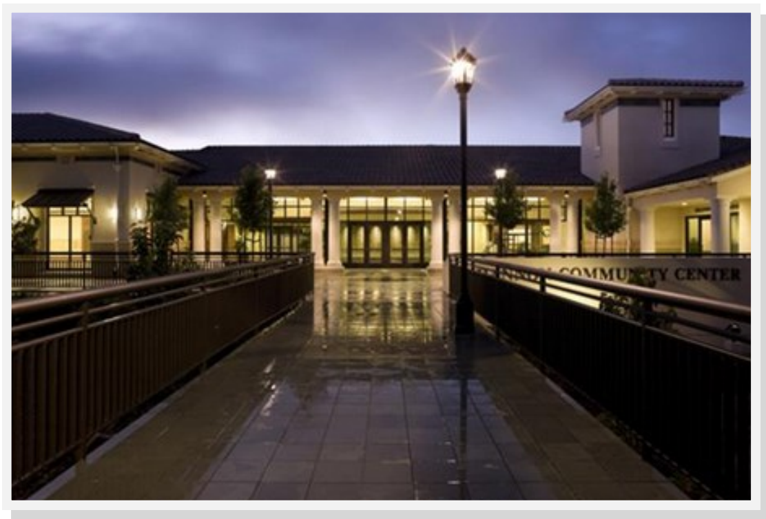
The Shannon Community Center